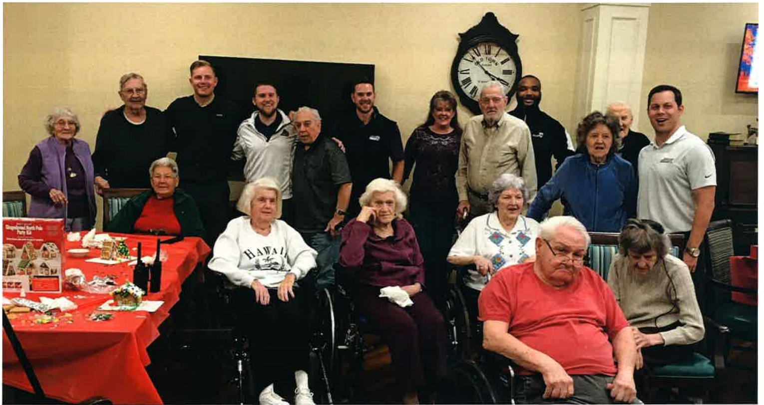
GINGERBREAD HOUSES IN REFLECTIONS, WITH JMU